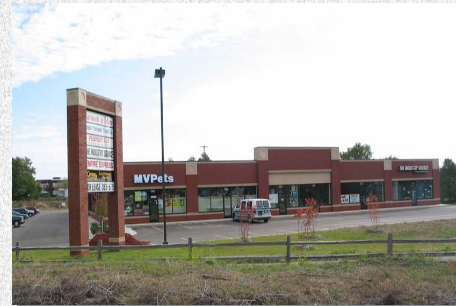
PORTAGE CENTER PLAZA PORTAGE, MI

Architectural design services for a new 25,000-square-foot multi-use office and retail facility.