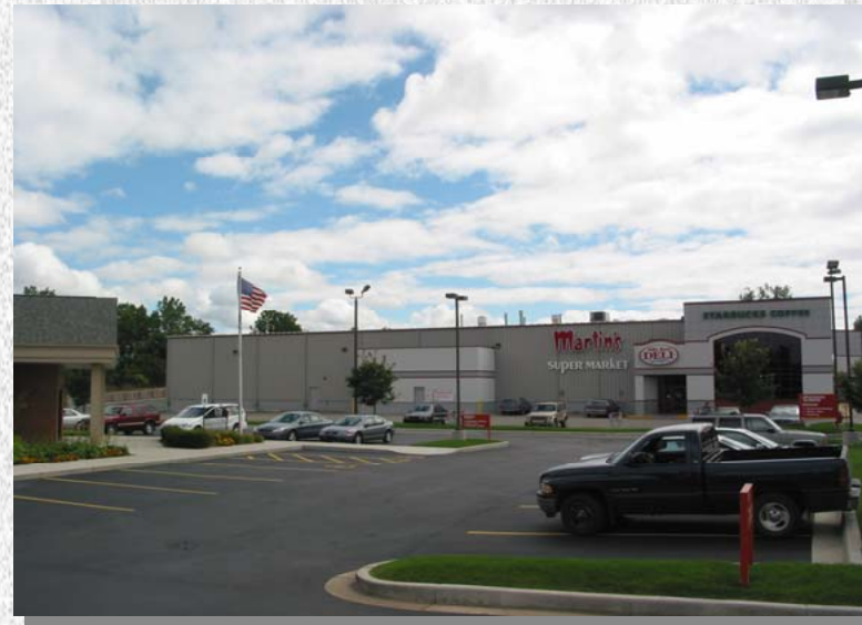
MARTIN'S SUPERMARKET ST. JOSEPH, MI

Provided site design services for a 56,200-square-foot supermarket and two 6,000 square-foot out-lot buildings. The site design required 20-foot cuts in the property, a difficult-to-handle combination of clay and sandy soils and a 56,000-cubic-foot underground stormwater detention system, all on a compact four-acre site.