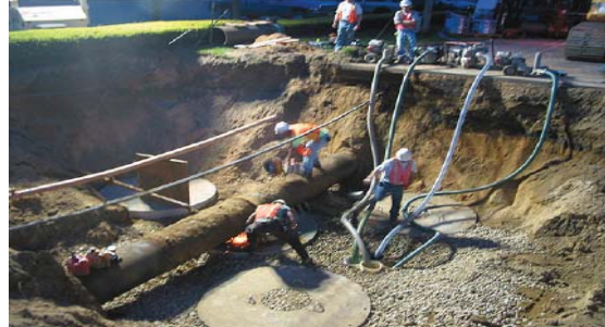
Cleveland Ave, St. Joseph, MI

PRSR1 STD U.S. POSTAGE PAID Benton Harbor, MI Permit No. 145