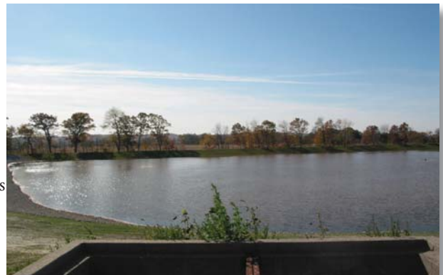
A new wastewater treatment lagoon was just one aspect of the Decatur project.

The U.S. Department of Agriculture, Rural Development program is an excellent source for rural community projects.